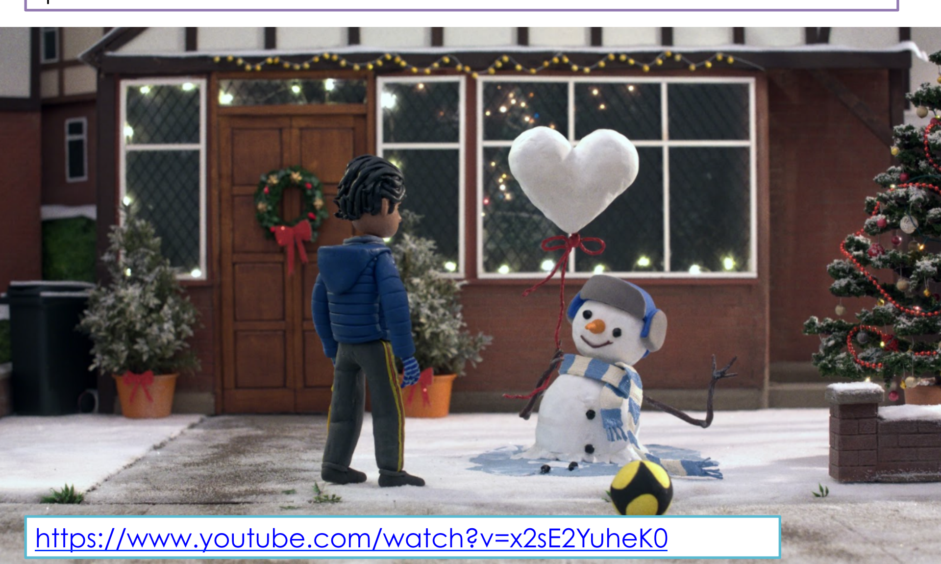
Task 1: Watch the new John Lewis advert which is all about spreading love and kindness wherever you go. Make a list of the things that the different people/ characters do to spread love and kindness.